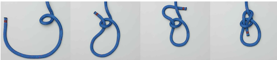
Trends in Cognitive Sciences

We argue that the emergence of a simple protolanguage in human evolutionary history greatly enhanced our analogy-building capability compared to that of non-human animals, catalysing the process of cumulative cultural evolution in our lineage (Figure 2, Key Figure). Although some analogical reasoning can be performed in the absence of language (Box 1), a form of protolanguage capable of simple verbal labels would have allowed early humans to link novel stimuli to familiar stimuli via analogical labels and to communicate this link to others (Figure 2). As highlighted in Figure 2, we are predominantly concerned with a stage of language evolution in which word labels are present, but abstract words such as 'similar/different' need not be. Although comparison terms are clearly important in analogy-making [47], our interest is in the more general property of all words to act as analogies [19]. Iconicity (i.e., a similarity between a