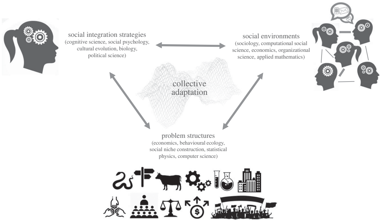
Figure 1. Collective adaptation can be seen as an emergent property of a complex socio-cognitive system driven by dynamic interactions of social integration strategies, social environments and problem structures collectives face. Collectives take different trajectories when navigating the complex adaptive landscape of these interactions. The system components are wholly entangled, but each has been studied in relatively isolated disciplines, and extant models of collective dynamics rarely include all components. Combining relevant findings and methods in different disciplines (box 1) is critical for understanding collective adaptation, avoiding parallel efforts (box 2) and building quantitative models that enable answering important outstanding theoretical and practical questions about human sociality.